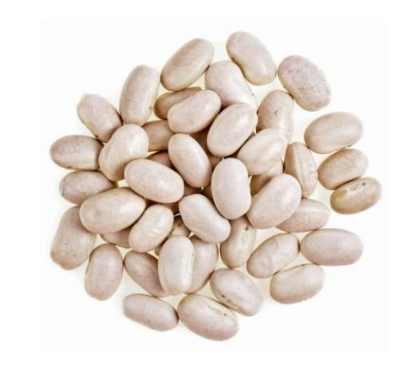
GREAT NORTHERN BEANS