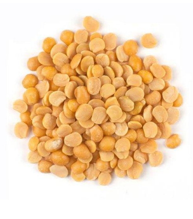
GREEN SPLIT PEAS YELLOW SPLIT PEAS