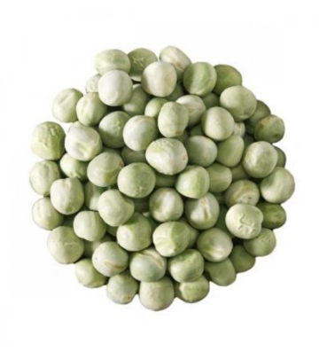
GREEN WHOLE PEAS YELLOW WHOLE PEAS