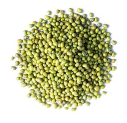
MOONG BEANS WHOLE