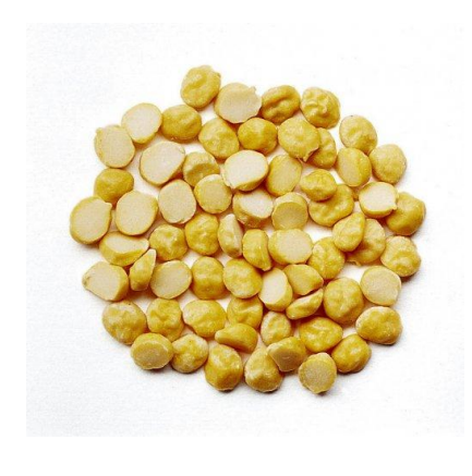
CHICK PEAS SPLIT