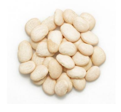
BABY LIMA BEANS