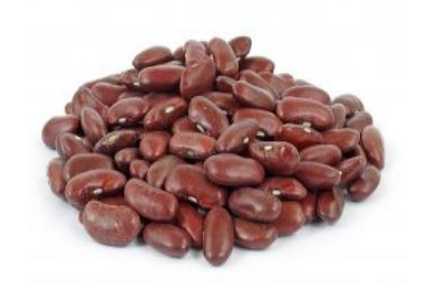
DARK RED KIDNEY BEANS