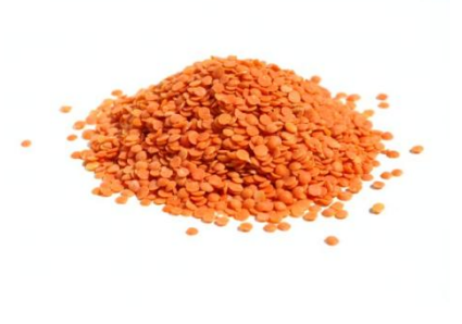
RED SPLIT LENTILS