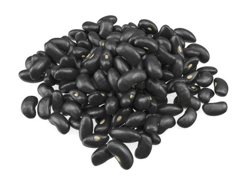
BLACK TURTLE BEANS